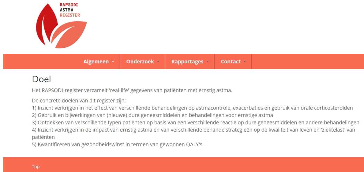
Fig. 2. Screenshot from the RAPSODI Register website (d.d. 17/6/2020)

We are very happy to announce that the RAPSODI registry website has been launched. There you can find the most relevant information regarding our registry, including publications, documents and milestones. You can access the website using the link: https://www.rapsodiregister.nl/